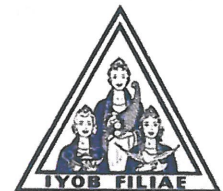
The International Order of Job's Daughters

Information From the Masonic Service Association of North America