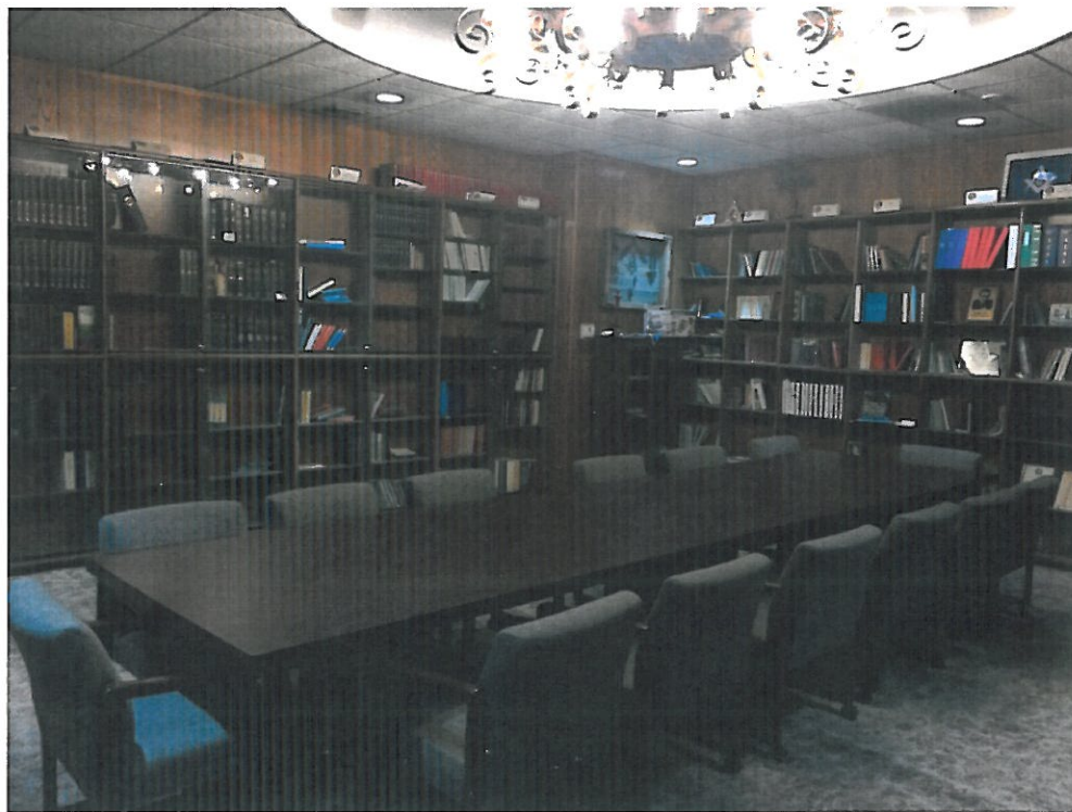
The MMT Library

In the center of the Masonic Memorial Temple is our library. These days the room is primarily used for meetings and proficiencies, yet it has over 300 Masonic books, tracts and memorabilia that are available for viewing. For easy identification, many of the books have been cataloged in the library's database . For more information see the Lodge Secretary.